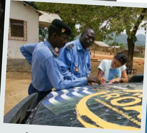
Police controls are frequent in Africa.