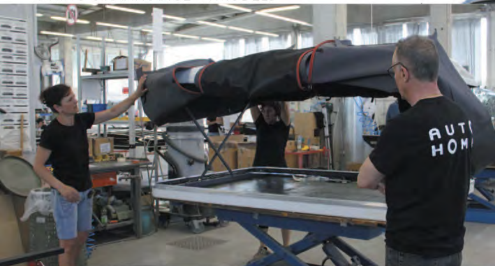
The assembly of the tent on the fiberglass shells, that comes from the molding is manual.