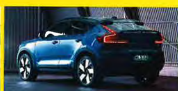
VOLVO C40 RECHARGE