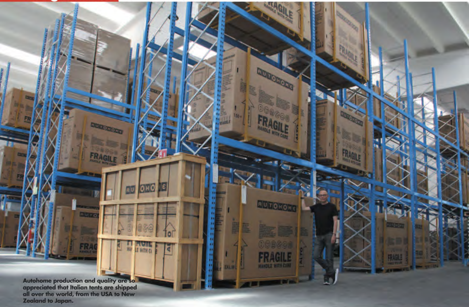
Autohome production and quality are so appreciated that Italian tents are shipped all over the world, from the USA to New Zealand to Japan.