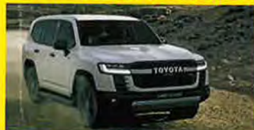
TOYOTA LAND CRUISER