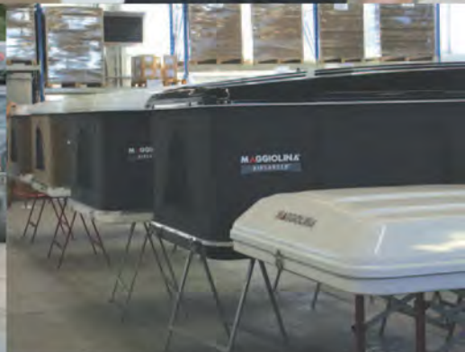
From the production unit, roof tents are shipped to give free rides to off-road adventure lovers.